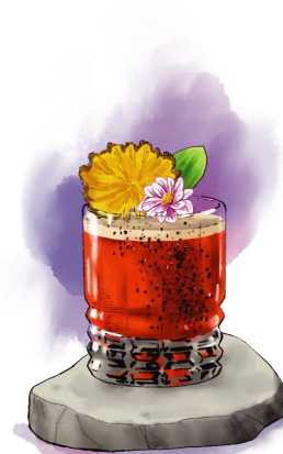
Bird of Paradise

A vibrant blend that captures the awakening of the island's spirit.