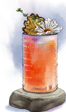
Home, Sweet, Home

Prices are subject to 10% service charge and 7% government tax